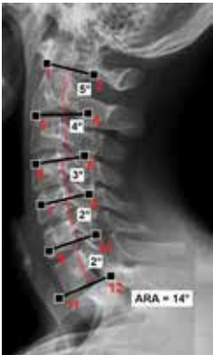
Absolute Rotation Angle